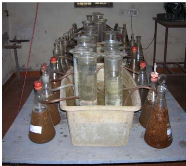
Fig. 1 Experimental set up for biogas production