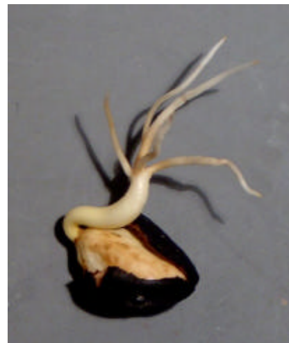
6 day old Jatropha germ