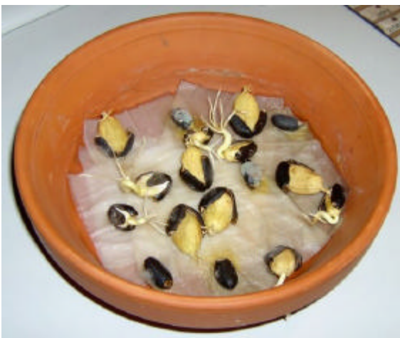
Flat bowl with soaked paper and germinated Jatropha seeds

The bottom of a bowl is covered with some layers of paper tissue (paper towel). This is soaked with excess water and the seeds are placed on it, so they lie about 1 mm in water. The bowl is covered with a lid, so the air in the bowl keeps very humid. The seeds start germinating after some days (3 to 5, depends on the temperature).