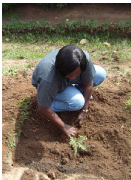
The minister planting a tree.