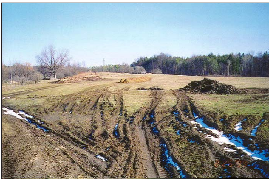
Site preparation avoids rutting.

Siting facilities well can also help to avoid water quality problems. A high water table may lead to flooding of the site which will make equipment access and operation more difficult. Flooding can also promote anaerobic conditions in the compost which may lead to malodors. A high water table or flow of surface water onto the site also increases the likelihood of leachate contamination of groundwater or nearby surface water. The shorter the distance leachate percolates through unsaturated soil, the less it undergoes natural biological and physical treatment. Moderate to good soil percolation rates are desirable to avoid standing water and to minimize leachate and runoff. Well-drained sites allow equipment to operate even in wet weather. County soil surveys that provide information on depth to groundwater, percolation rates, and soil types are usually available at the local office of NRCS.