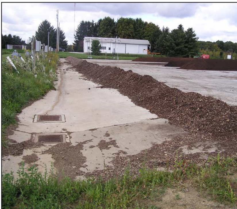
Compost berm at Ohio State composting site. Collected runoff is treated in a wetland before disposal.

Leachate, formed when water percolates through the organic material, can be harmful to ground and surface water, because it can deplete oxygen and may contain unacceptably high levels of nitrogen phosphorus or pollutants. An initial bed of carbonaceous, bulking materials underneath the compost pile can help absorb excess moisture and keep it in the windrow. If the compost site is at the bottom of a slope, berms can be built to divert runoff water around the pad.