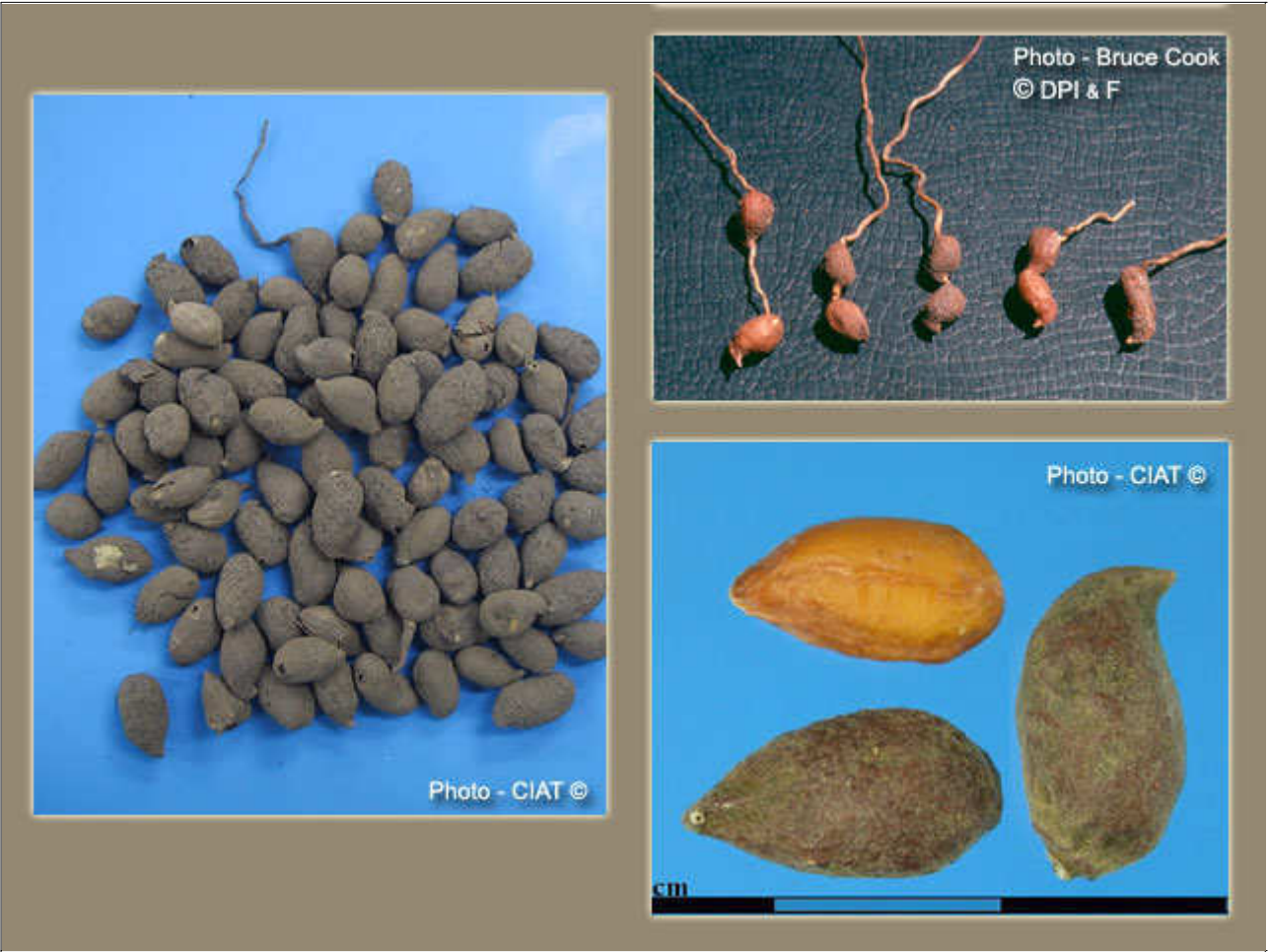
Geocarpic pods, and seeds.