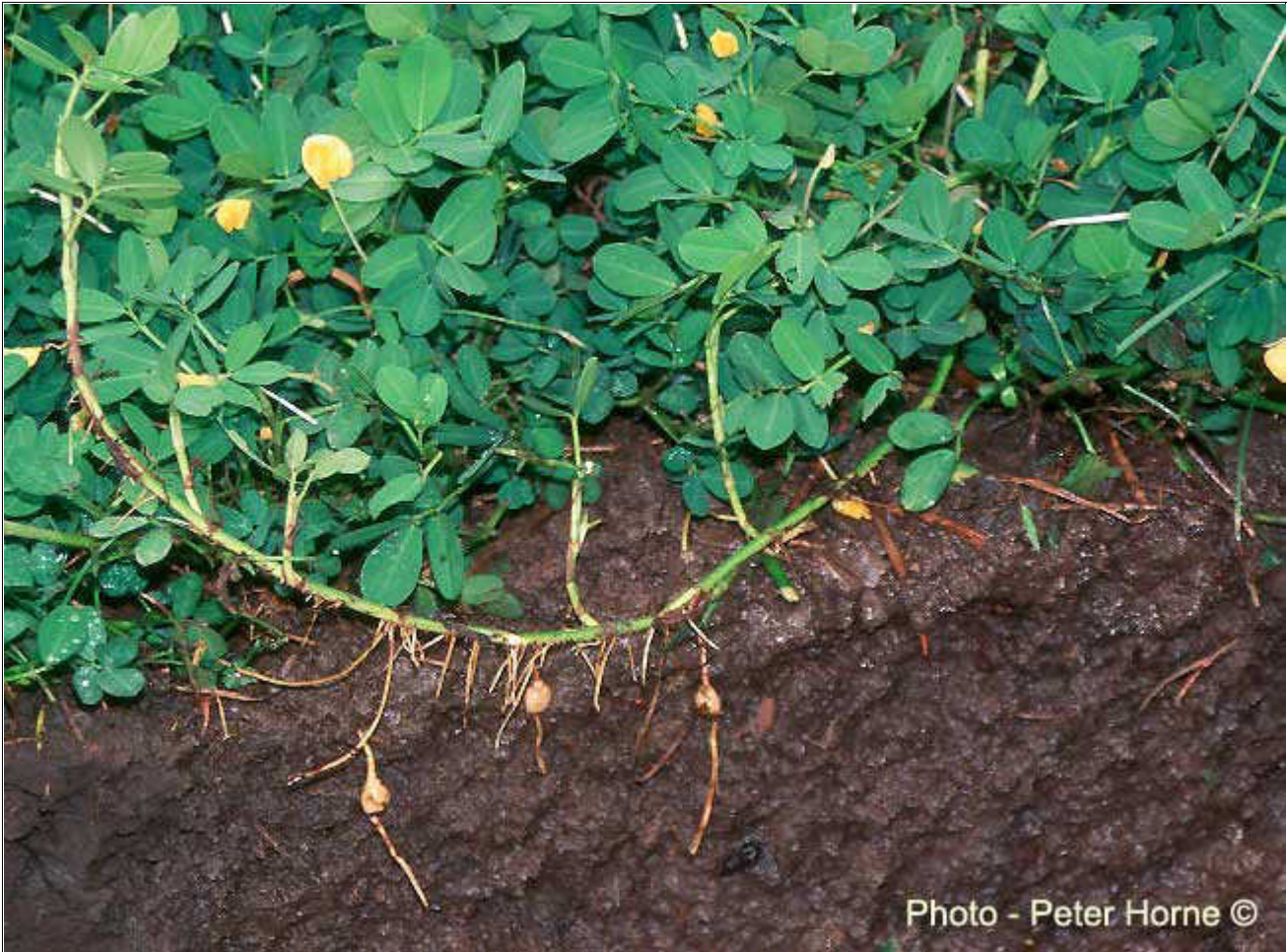
Geocarpic pod formation.