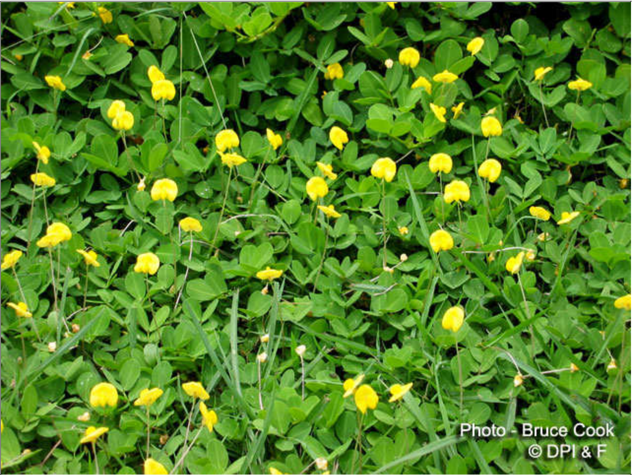
Foliage and flowers.