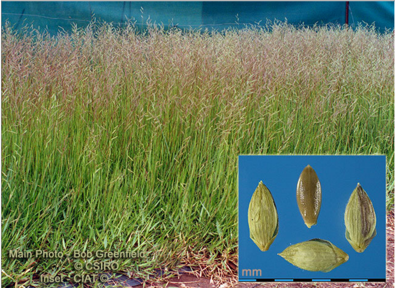
cv. Llanero seedcrop and seeds.