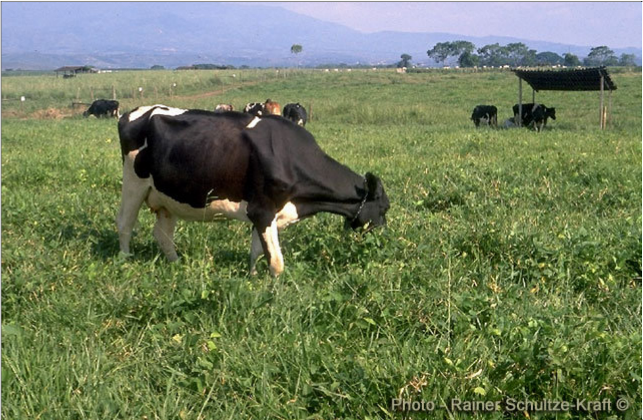
cv. Llanero with Centrosema macrocarpum , being grazed in Colombia.