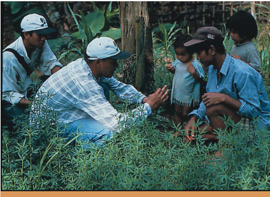
Working with farmers to evaluate forages in northern Laos (JH)

When we know the farmer's particular problems, we can choose suitable ways of growing and using forages that will provide the best solutions.