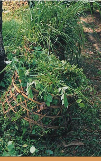
Offer a basket of choices (PH)