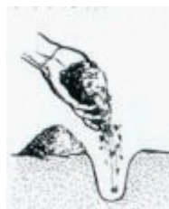
Putting farmyard manure into hole ready for planting