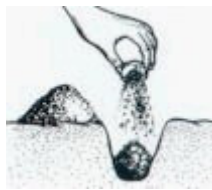
Putting Dap into hole ready for planting