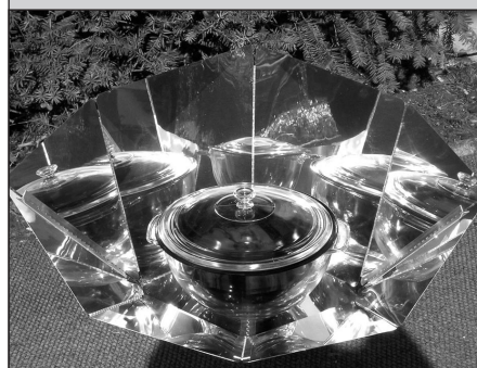
Figure 4 HotPot panel cooker (photo: Christine Danton, SHE Inc).

The third and most recent design is the panel cooker. Its major features are low cost and increased portability, as the panels are hinged and can be folded up. Invented by Dr. Roger Bernard, it was initially adapted by Solar Cookers International for use in refugee camps. A commercial model developed by Solar Household Energy, Inc. is now available. In this model, called the HotPot, a black steel cooking pot with a wide flange is suspended inside a transparent glass bowl with a space of 1.3cm between the two. This assembly is covered with a glass lid and placed in front of a foldable reflector designed to deliver solar energy through the glass bowl to the black pot. The resultant heat is retained between bowl and pot by the pot's flange (Figure 4).