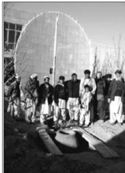
Figure 3 Scheffler cooker

The most powerful solar cooker is composed of a paraboloid reflector and a bracket to hold a pot. The reflector bends the rays of light so that they are concentrated at a focal point under the pot, making it very hot indeed. The focal point is so hot that this kind of solar cooker can fry food, unlike the other types of solar cooker. These cookers work like the burner on an LPG stove. Dr. Dieter Seifert developed a series of very efficient cookers of this type that are now in use around the world. Wolfgang Scheffler designed an 11-square meter reflector that concentrates intense solar energy onto an area about 30 centimeters in diameter. It is used for solar cooking on an institutional scale. (Figure 3)