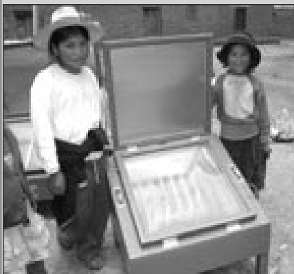
Figure 2 Box oven, Bolivia

The box oven was introduced in the 1950s by Dr. Maria Telkes. A popular model has a hinged, transparent top of glass or plastic and the inside of the box is black. Sunlight passes through the glass, strikes the black-painted inside of the box and the light is converted into heat, which cooks whatever is in the box. Box cookers can be of any size and can contain several pots. They can be hand made, even out of cardboard, and work well. The way they work is very similar to ovens (Figure 2).