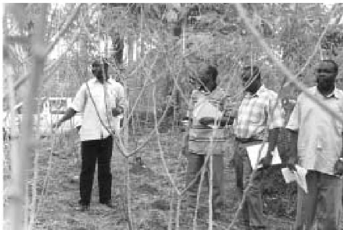
Some members of Team 1 at an on-farm trial in Akwa Ibom State.

As solutions, ADPs should start early to identify farmers and sites for the 2004 trials. The logistics to do this should also be provided early enough to ensure that trials are not isolated from farmers' fields. Existing information on fertilizer use should be made available to farmers in addition to linking them to supply sources. Rural friendly, pest control approaches such as sprinkling liquid fermented goat dung on plants to keep goats away should be exploited. Communities can also be assisted to develop local legislation against animal damage.