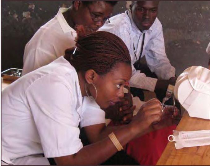
FP training-of-trainers session