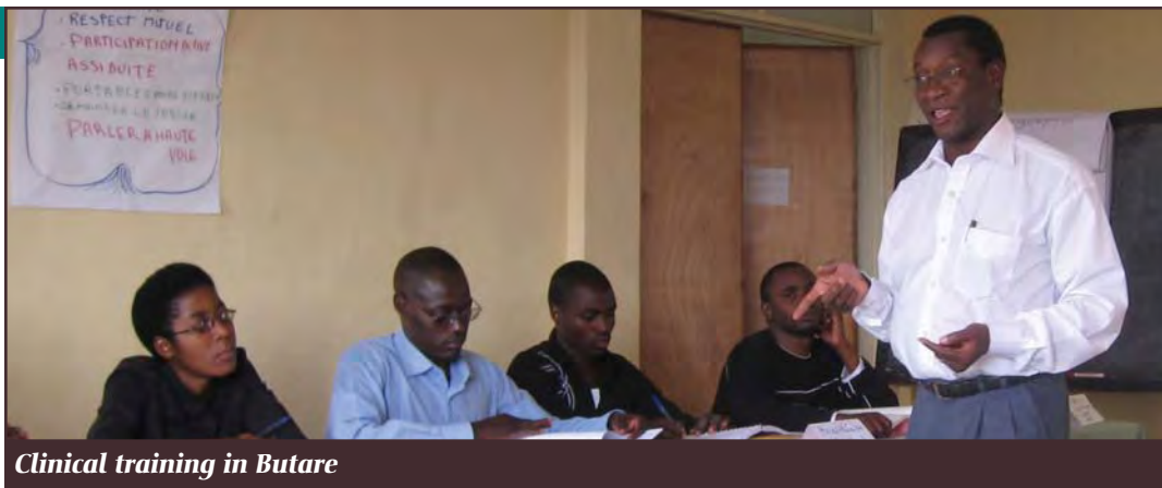
Clinical training in Butare

The Capacity Project also noted that some clinics run by faith-based organizations (FBOs) did not offer the full range of FP services, since their belief system does not allow them to promote contraception. To increase access, Project staff worked with FBOs on a strategy to provide modern FP methods in nearby secondary posts. Staff at these FBO clinics now provide the Standard Days Method and refer clients who choose other methods to the secondary posts. The Project has renovated and equipped 21 secondary posts.