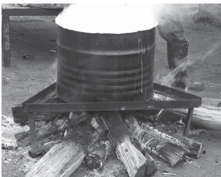
Figure 2 Inefficient firewood cooking lauderdale tea factory in Mulanje district