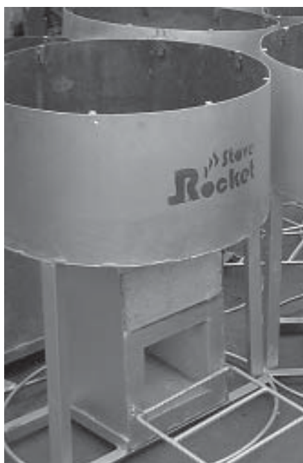
Figure 7 WFP type of stove: lower skirt, less L-shape at the entrance to cut costs, designed for half-220l gallon oil drum

living the 'stove abuse' there is fit for normal use. Dedza pottery developed hard, high-density tiles about 1 cm thick, made out of the same white clay mentioned previously, resistant against physical shock and abrasion. They are interlocking and fitted on the lower part of the fire chamber to protect the area in direct contact with the firewood. It is always a challenge to balance the durability versus the insulative properties of a stove. So far the tiles used since October 2006 have not reduced the efficiency of the institutional stoves as the heat