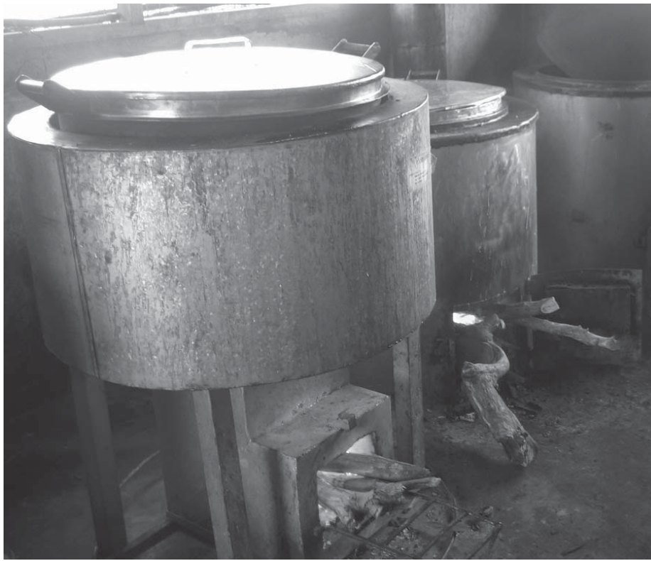
Figure 4 In this school in Tanzania, this sight of a Bellerive-type stove, right, being used with long uncut pieces of wood and the door left open is not uncommon. However, it is still an efficient stove compared to the 3 stone fire, even when the door is open. Its high cost has prevented further dissemination