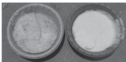
Figure 6 Caked food from traditional fire, left, and from rocket stove, right, with same maize flour used

wood. The only requirement is to split the wood lengthwise into pieces ideally around 3-6 cm thickness, which is not as strenuous as cutting. Also, less wood needs to be prepared due to the economy of the stove on firewood use (Figure 5).