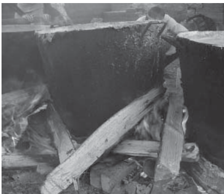
Figure 1 Inefficient firewood cooking at Maula prison

A survey conducted in 2003 in Malawi revealed that the majority of institutional cooking was done with firewood using inefficient technologies, including open fires (Figures 1 & 2). The Bellerive-type, which is an excellent, but expensive stove, was only found in a few places, as its selling price in Malawi is beyond the reach of most customers.