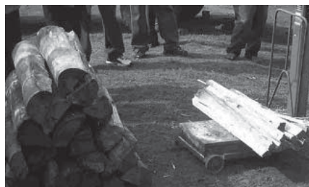
Figure 5 Less wood is needed to cook the equivalent amount of food with a rocket stove