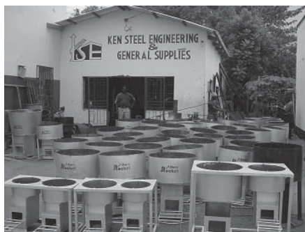
Figure 8 Stoves waiting to be loaded at Ken Steel Engineering in Mulanje

loss through the tiles is compensated by the longer cooking times in the institutions. The tiles have enticed some producers to increase the warranty for the stoves from 6 to 12 months. ProBEC constantly monitors the performance of the stove components and adjusts ma-