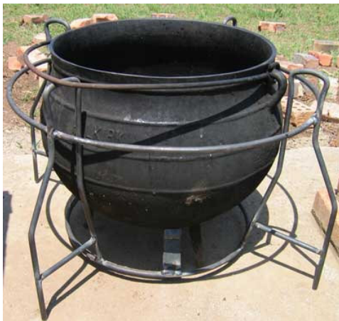
FALKIRK NO 25 IN THE STEEL FRAME