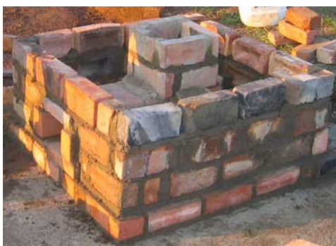
LOWER SECTION SHOWING FUEL FEED HOLE