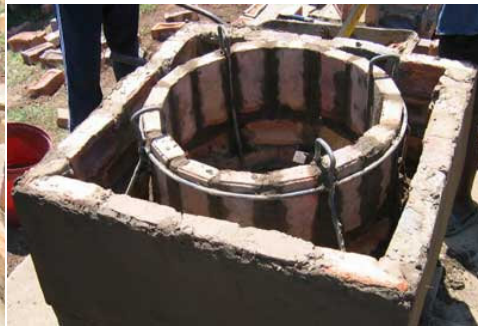
DRUM FINISHED BEFORE PLASTERING