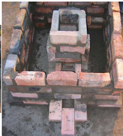
AIR INLET AND CLEANOUT HOLE