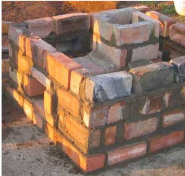
LOWER SECTION SHOWING FUEL FEED HOLE

Crispin Pemberton-Pigott, New Dawn Engineering, Swaziland, November 2005