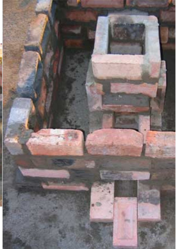
AIR INLET AND CLEANOUT HOLE